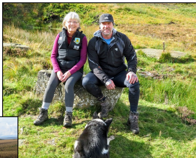
MEMBERS enjoyed a lovely seven-mile walk from Clough Head in Haslingden taking in Tor Hill and High Moss.