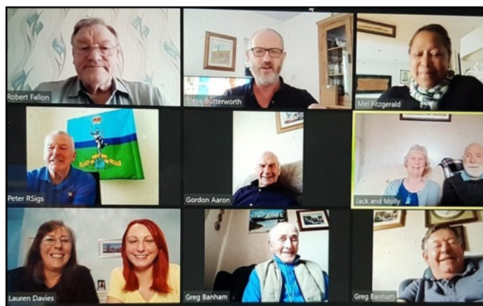
The Sandbag Cafe goes on Zoom

The online meeting for residents of Rochdale, Heywood and Middleton is at 11am on Tuesdays. At its busiest it had 14 members joining in.