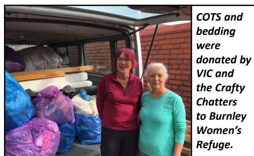
COTS and bedding were donated by VIC and the Crafty Chatters to Burnley Women's Refuge.

VETERANS turned out in force despite the weather to support Haslingden Street Fair. Information and awareness stands were held and arts and crafts went on display. Thank you to the VIC Singing Group who switched to an indoor concert when rain put paid to the planned open air performance.