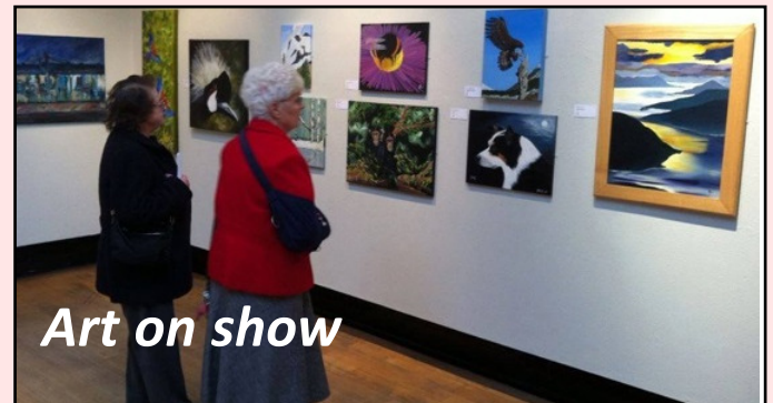
Art on show