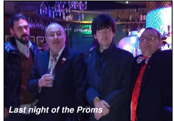
Last night of the Proms

was such a success VIC is looking to repeat it at Easter. The funding will also help towards the cost of outdoor and social inclusion activities planned by the charity for the next year.