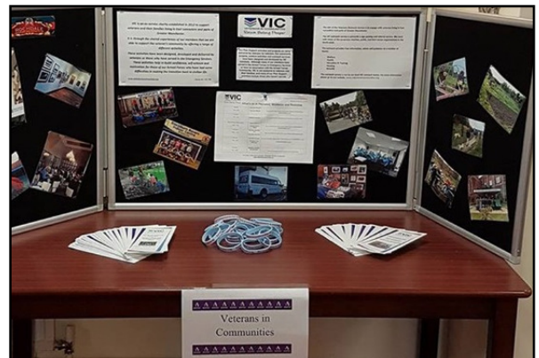
TO RAISE awareness of the work of VIC an information stand was held at Anchor Homes' Brackenhall Court in Heywood.

"We already have the kit that was kindly donated by Lifestylish.com of Bacup and if you would like to join the team contact 01706 833180."