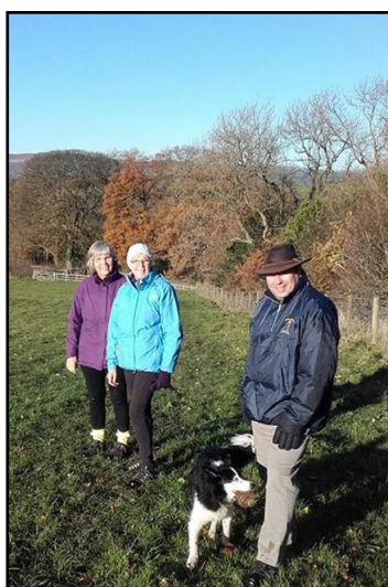
OUTSTANDING views were enjoyed by walkers on a four-mile trek around Downham.