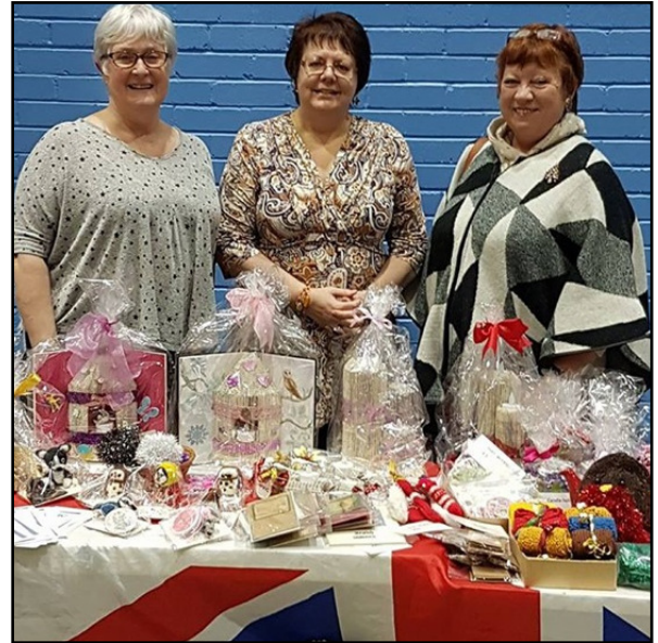
CRAFTS made by our Crafty Chatters went on sale at a Christmas Fair at Haslingden Sports Centre.

"In January we are working with them to organise a team game between VIC and some guys from their teams, thankfully it's not the Burnley FC first team, but a team already on one of their programmes. "We had good success with our 5-a-side team in Blackburn. I need to know who would want to play, you never know I might even dust off my trainers for a game... even if it is played with the wrong shaped balls!"