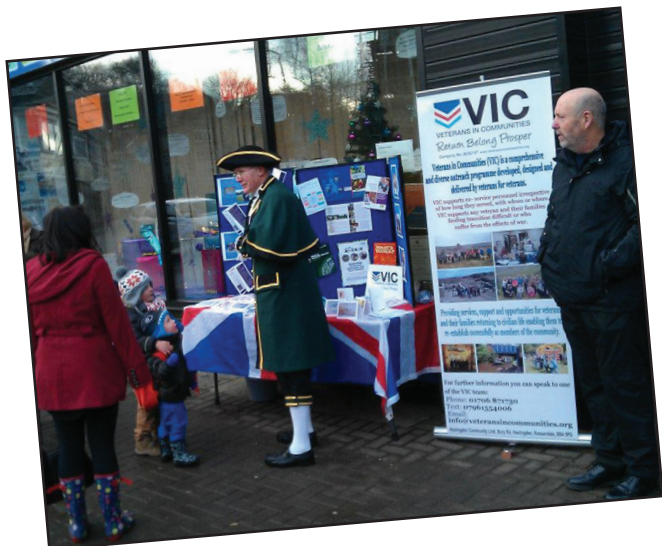
Bacup Christmas Market

Since coming here I have started to regain my confidence and I have completely surprised myself - the last time I did art was in school and my teacher shook his head. I started off on painting with numbers and now I paint places I have been. I find myself able to switch off and drift away from everything.