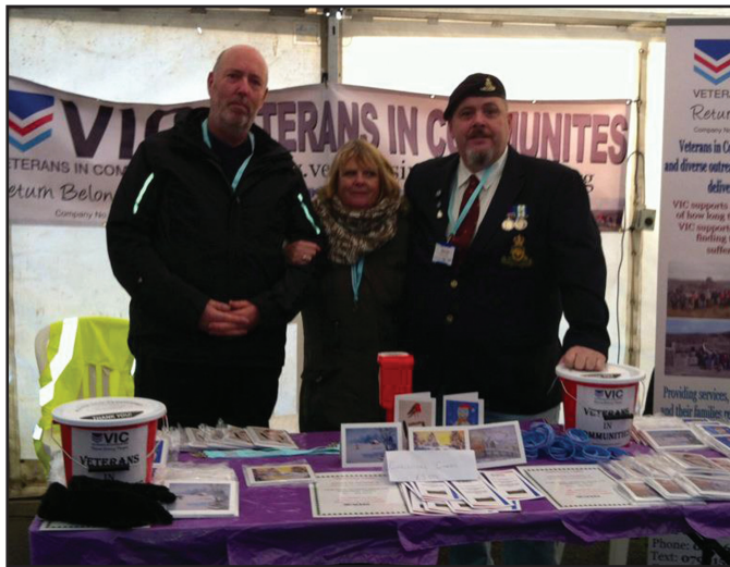
Clogs On T'Cobbles in Rawtenstall