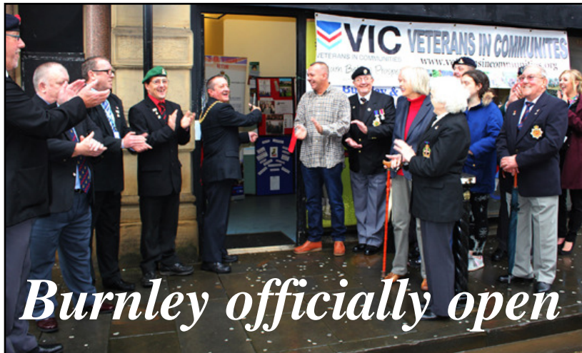
Burnley officially open

First World War, they formally ended 'at the 11th hour of the 11th day of the 11th month' with the signing of the Armistice.