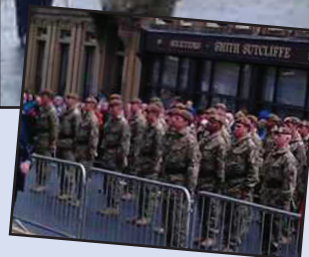
On parade outside the Town Hall in Burnley