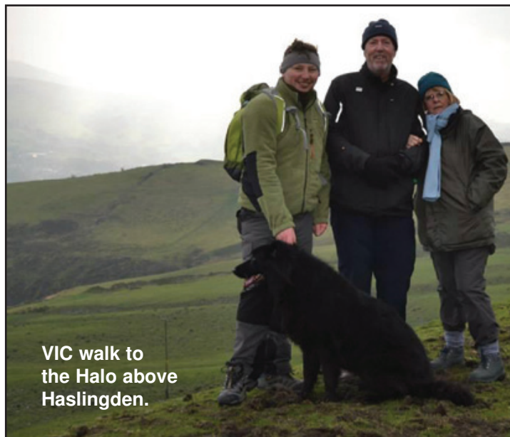
VIC walk to the Halo above Haslingden.

VIC would like to thank the Chamber of Commerce for their support and the kind donation.