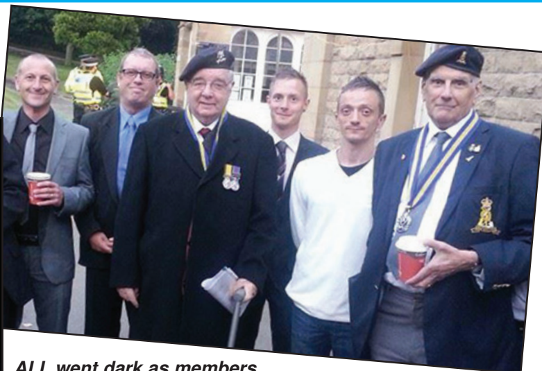
ALL went dark as members of VIC Darwen Outreach joined in the 'lights out' commemoration for the start of the First World War. For an hour, all electric lights were extinguished and just a single candle was used for illumination.